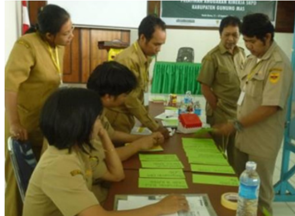
Participants are working in groups on cycle of government annual planning