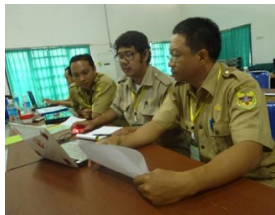
Participants is working on Renstra and Renja Analysis