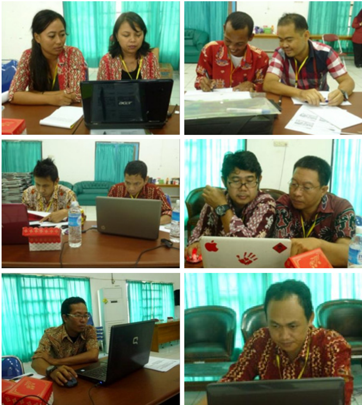
Participants expression when the Renstra and Renja analysis session.