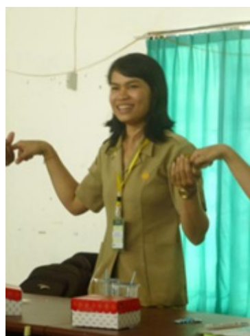
Ice breaker "Catching Finger"