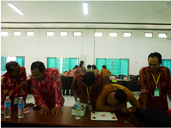
Participants are preparing strategy for the game