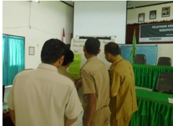
Participants are filling in training need identification form