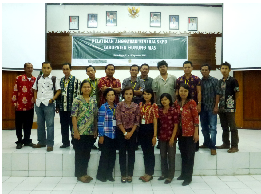
All Performance Based Budgeting Training Participants and Trainer