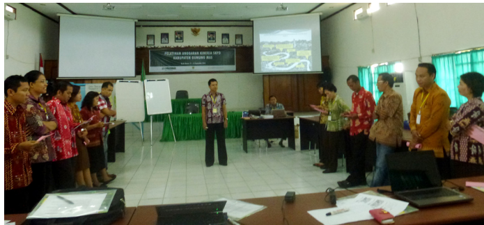
Review Session – Day 2