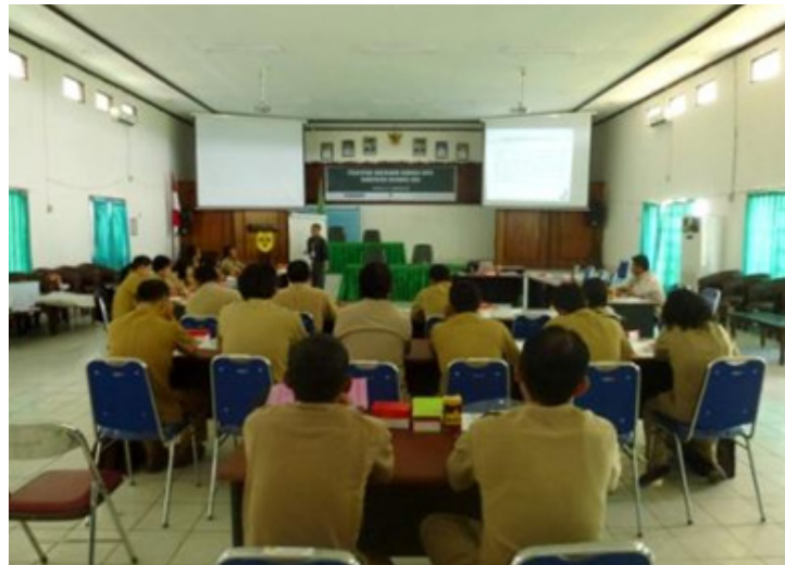
Presentation and plenary discussion on Principles of Performance-Based Budgeting