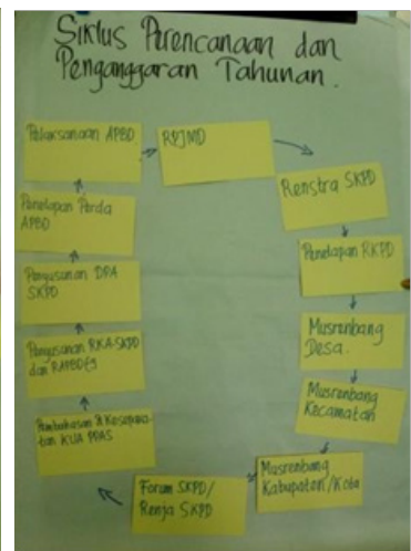
Result of group 1, 2, 3 works on cycle of government annual planning